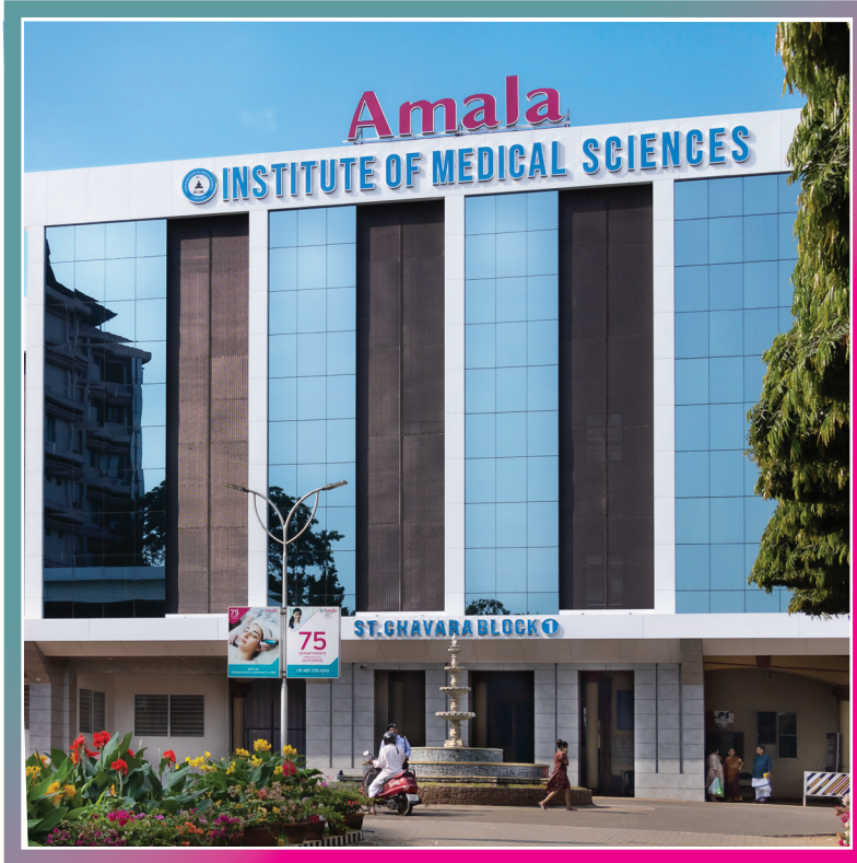
AMALA INSTITUTE OF MEDICAL SCIENCES, THRISSUR (Affiliated to the Kerala University of Health Sciences)