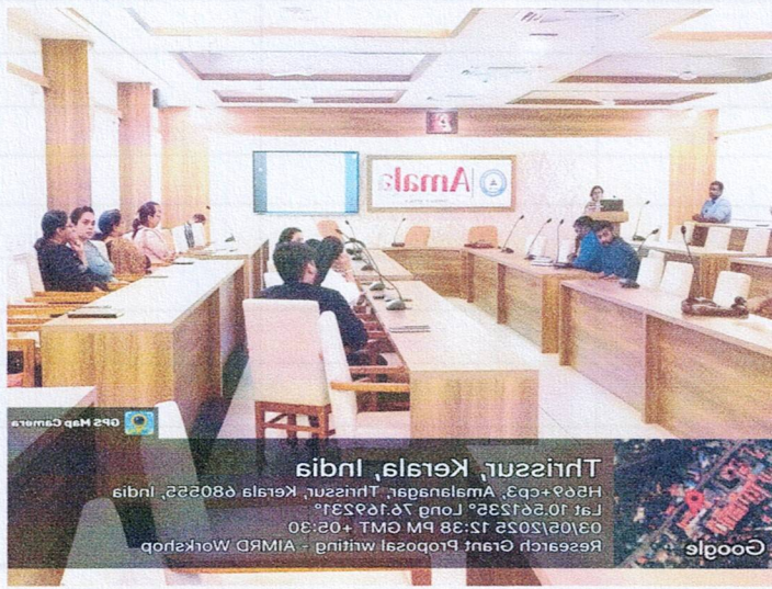
Thrissur, Kerala, India H569+cp3, Amalanagar, Thrissur, Kerala 680555, India Lat 10.561235° Long 76.169231° 03/05/2025 12:38 PM GMT +05:30 Research Grant Proposal writing - AIMRD Workshop