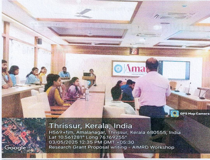
Thrissur, Kerala, India H569+fjm, Amalanagar, Thrissur, Kerala 680555, India Lat 10.561281° Long 76.169255° 03/05/2025 12:35 PM GMT +05:30 Research Grant Proposal writing - AIMRD Workshop