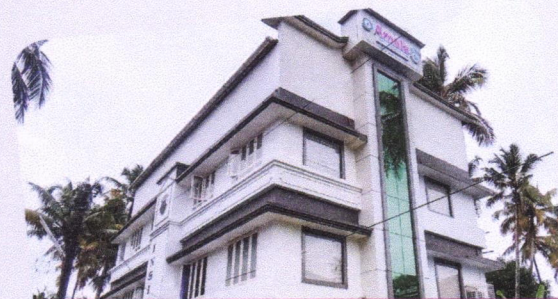
Urban Health Training Centre (UHTC) Chettupuzha