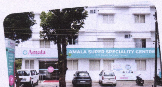
Super Specialty Centre Pattikkad