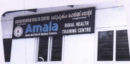
Rural Health Training Centre (RHTC), Vellattanjoor