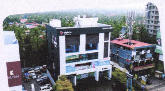
Amala Day Care Oncology Clinic Poonkunnam