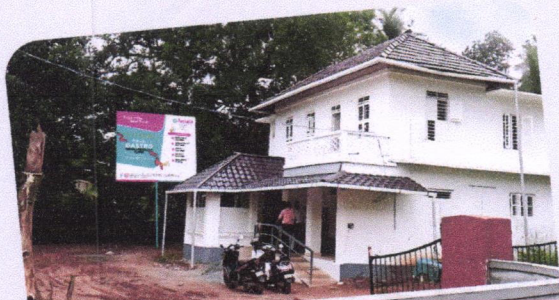
Amala Gastro Centre Arthat