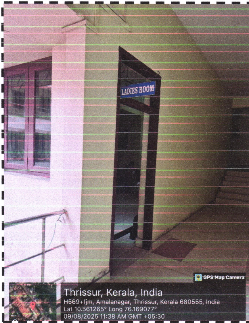
COMMON ROOM - GIRLS

Measurable point: Common Rooms for Boys and Girls with washroom facility