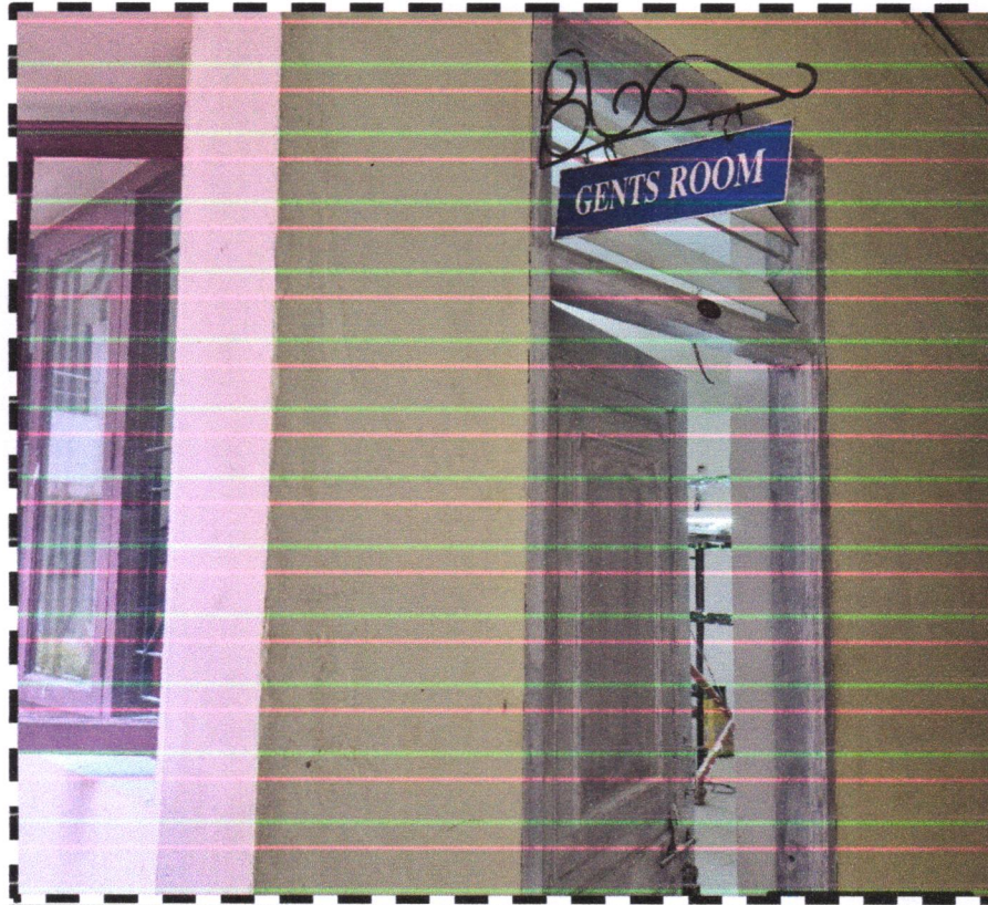
COMMON ROOM - BOYS

Measurable point: Common Rooms for Boys and Girls with washroom facility